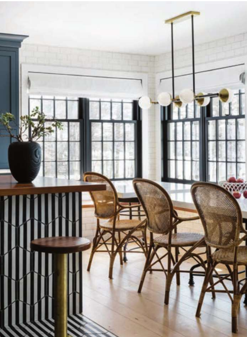
Bold design choices complement classic New England architecture in this unique home overlooking the water.

"I love everything about my kitchen, but my favorite design element has to be the cozy seating area," Jackson says. "Not only is it an easy way to add a quick pop of color to balance the room out, but everyone is drawn to the kitchen because that is where the action is. I think the kids have spent more time snuggling on the love seat with a book than anywhere else in the house."