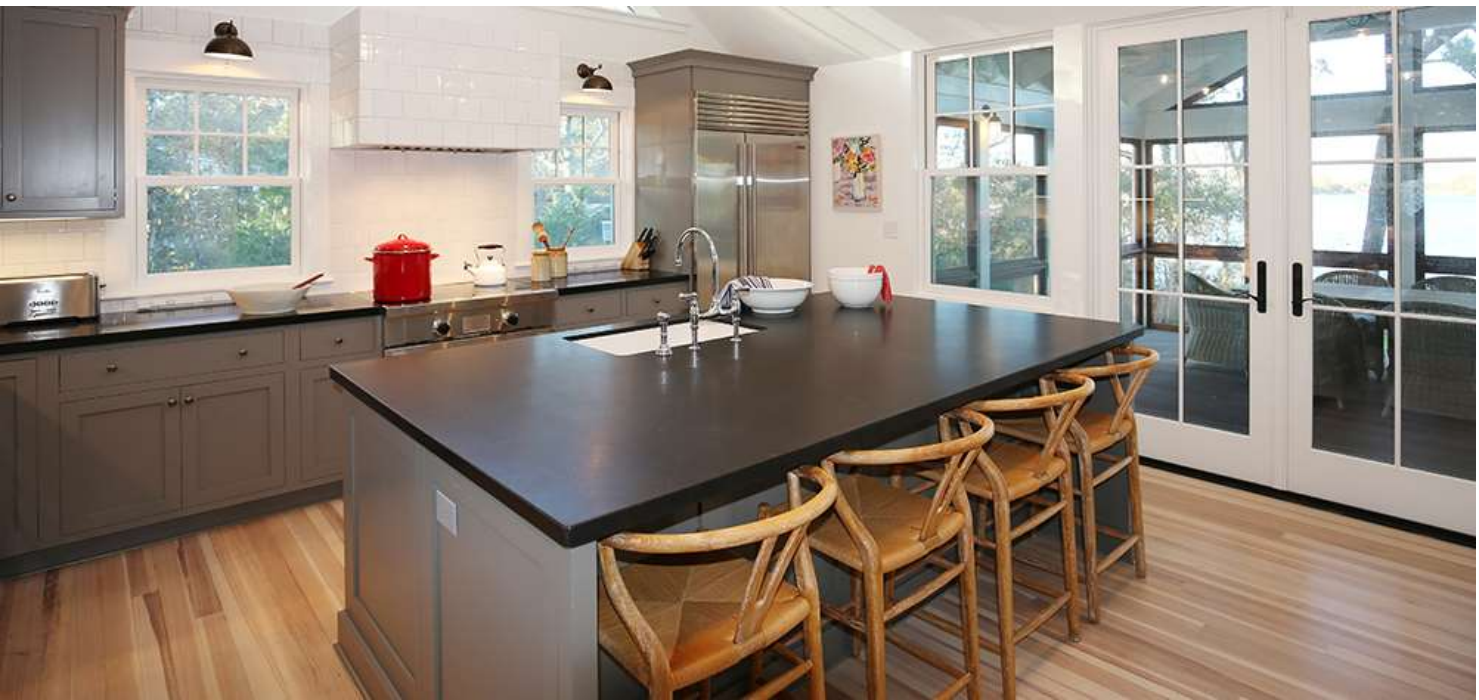
Vermont Cabinetry designed cabinets for this modern, Shaker-inspired kitchen. White walls and ceiling, combined with a light finish on the floors and darker cabinets, all help reflect natural light into the space.

The kitchen skylights and clerestory windows allow an abundance of light, and are grounded by Vermont Cabinetry modern Shaker-style cabinets painted in Farrow and Ball Mole's Breath. Black granite countertops hide everyday wear and tear, and the warm, neutral color scheme pops against the wall or lush green trees seen through the exterior windows.